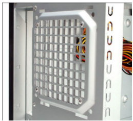
Wave Guide Design